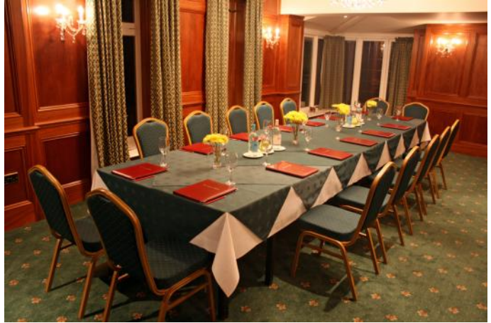
The Wessex Room